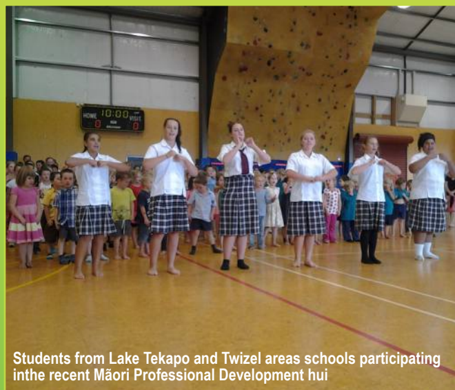
Students from Lake Tekapo and Twizel areas schools participating in the recent Māori Professional Development hui

Community & Public Health 18 Woollcombe Street P O Box 510, TIMARU Phone: 03 687 2600 Fax: 03 688 6091 www.wavesouthcanterbury.co.nz